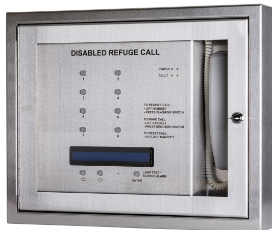
K41208SST (Loop) / K41108SST (Radial)