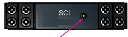
Short Circuit Indicating LED