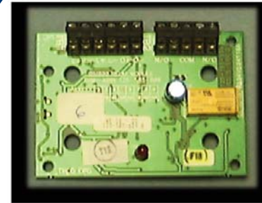
Fig. 1 EV-OP Relay Interface Module