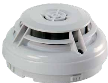
High Sensitivity Smoke Sensor