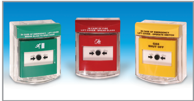
Call Point Stopper colours available

The Call Point Stopper is supplied in red with operating instructions: 'IN CASE OF FIRE - LIFT COVER BREAK GLASS'. Alternative and custom markings available.