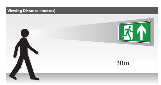
Note: Image not to scale and for pictorial reference only