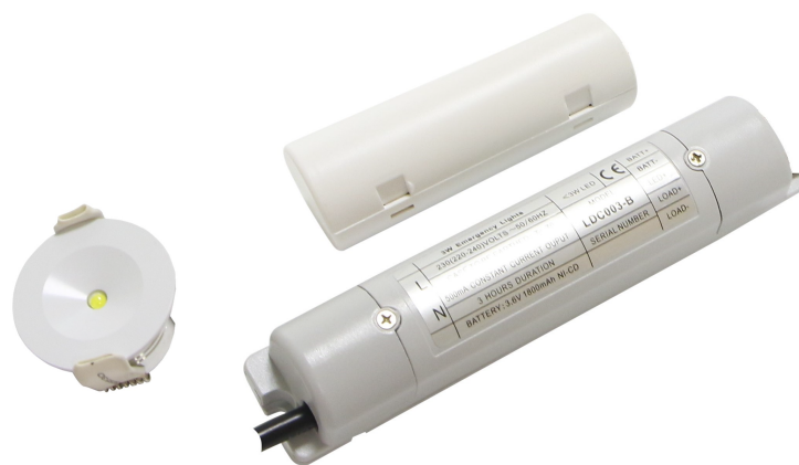
Image above shows module, battery and white lamp head Image below shows black & silver bezel options